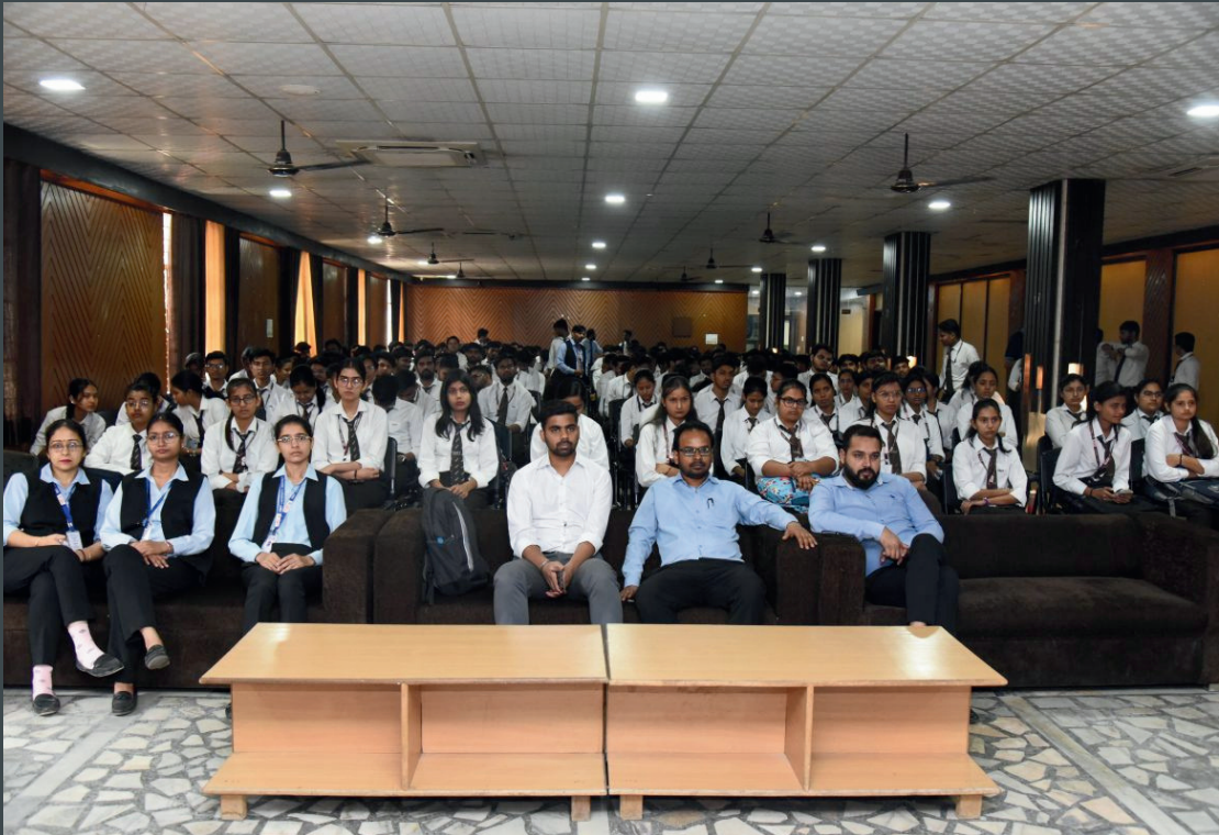
Picture - IIMT University students attending the "Neovation 2025" organized by IIMT BIF in collaboration with Nasscom Foundation. Students shows enthusiasm in understanding business ideas and fostering innovation.