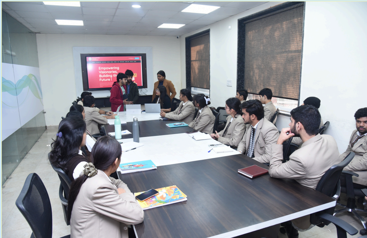
Picture – Students of IIMT University presenting their innovative ideas and prototypes before an esteemed panel of experts during the mentorship session, reflecting creativity and innovation.