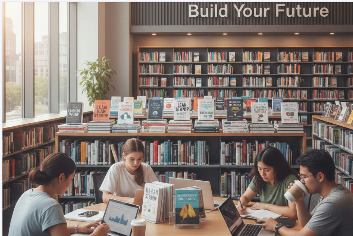
Picture – A symbolic representation of a Startup Learning Corner, reflecting how knowledge, reflection, and innovation come together to inspire entrepreneurial thinking.

A thoughtful corner to inspire aspiring entrepreneurs with practical wisdom, bold strategies, and simple steps to turn passion into profit. Because true entrepreneurship begins when you take action on your ideas and create value.