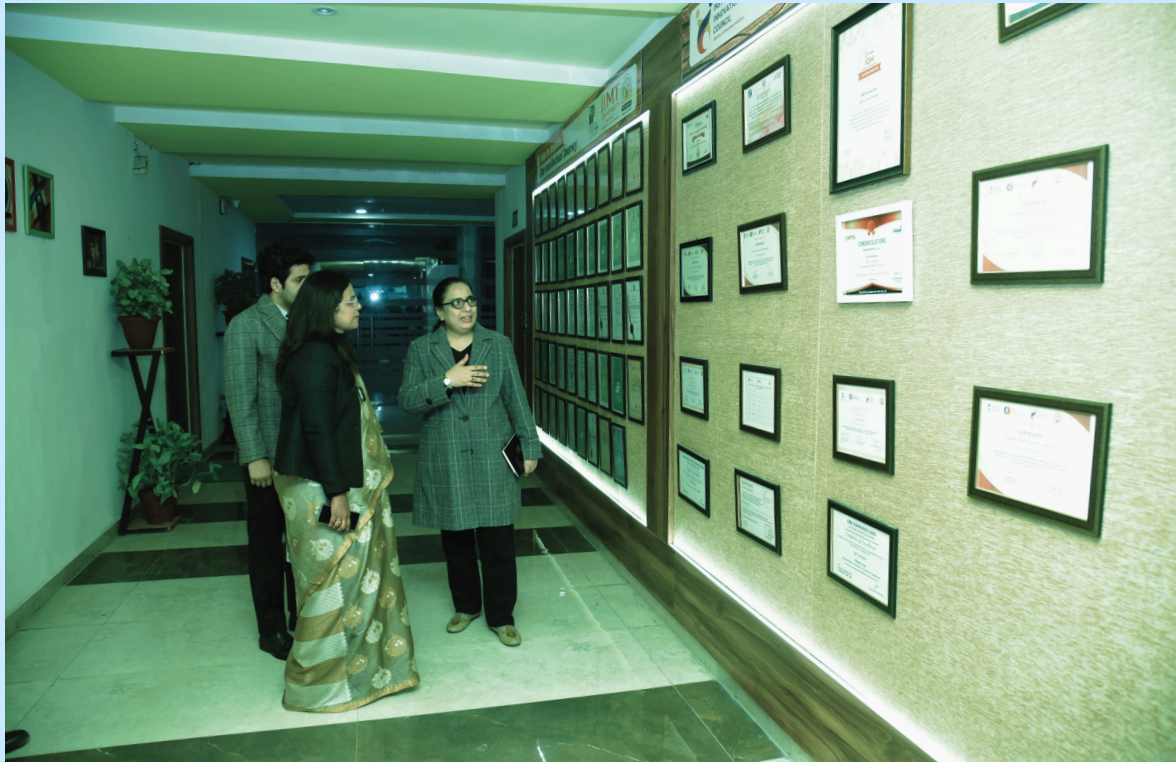
Picture – Visit to the IIMT Business Incubator, highlighting its infrastructure, startup ecosystem, and key achievements in fostering innovation and entrepreneurship