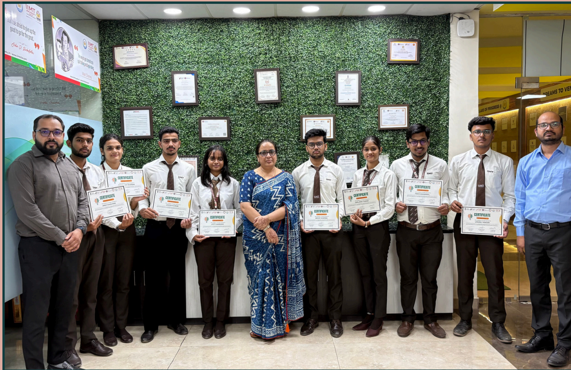
Picture – Students proudly showcasing their certificates during the ceremony, reflecting their enthusiasm, achievement, and commitment to innovation and excellence.