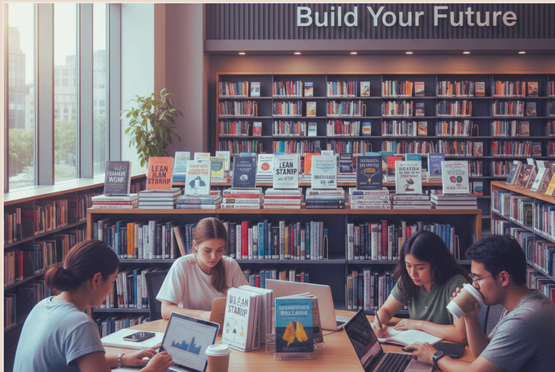
Picture – A symbolic representation of a Startup Learning Corner, reflecting how knowledge, reflection, and innovation come together to inspire entrepreneurial thinking.

A thoughtful corner to inspire aspiring entrepreneurs with practical wisdom, bold strategies, and simple steps to turn passion into profit—because true entrepreneurship begins when you take action on your ideas and create value.